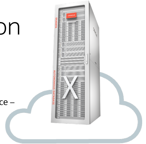
Oracle Exadata Cloud@Customer X11M

Run Oracle's most powerful, available, and flexible cloud database service – Oracle Exadata Database Service – in your data center on Exadata Cloud@Customer